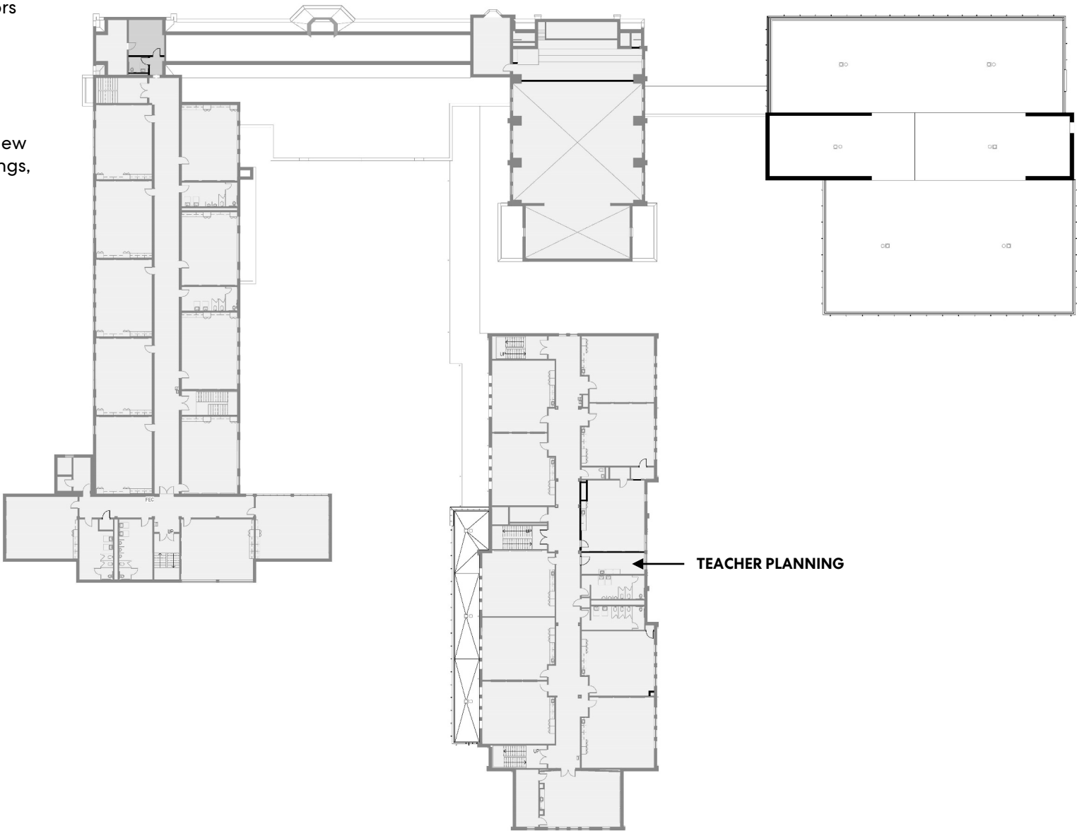
Level 03 – (Revised based on pricing)