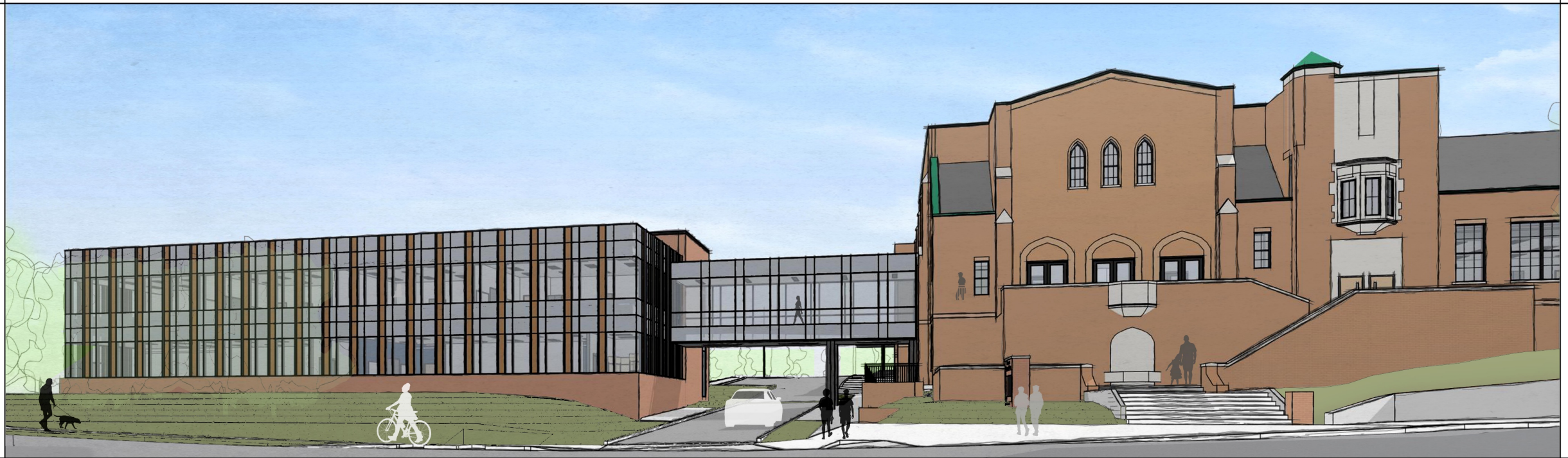
North Elevation – East Rock Springs Rd.