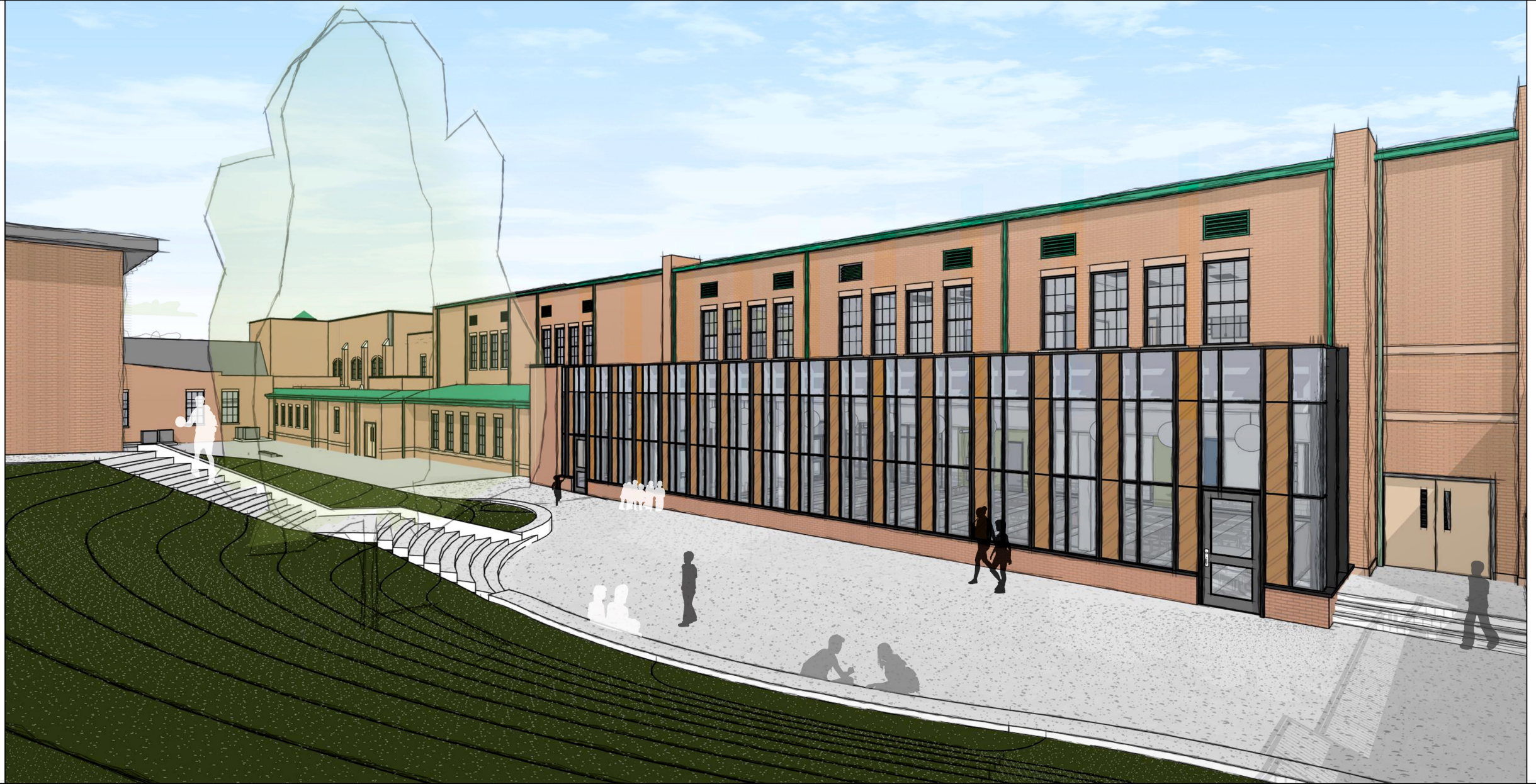
Cafeteria Expansion *revised renderings based on pricing