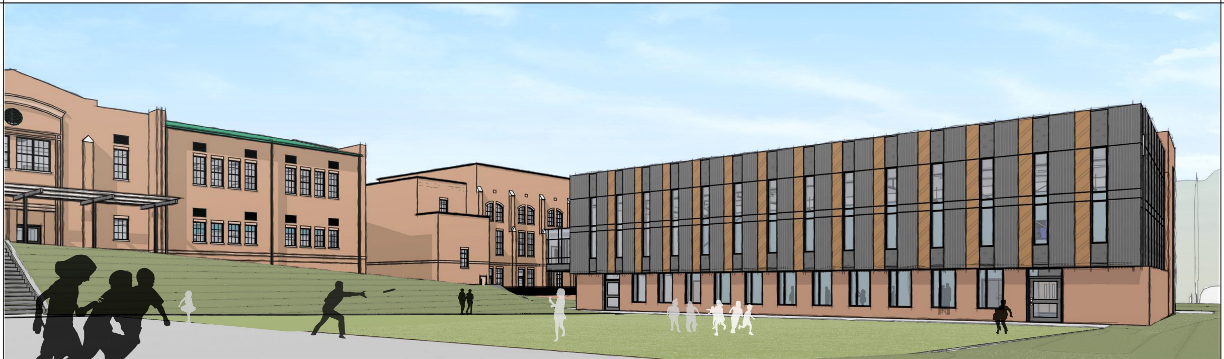
South Elevation – Gym & Playfield